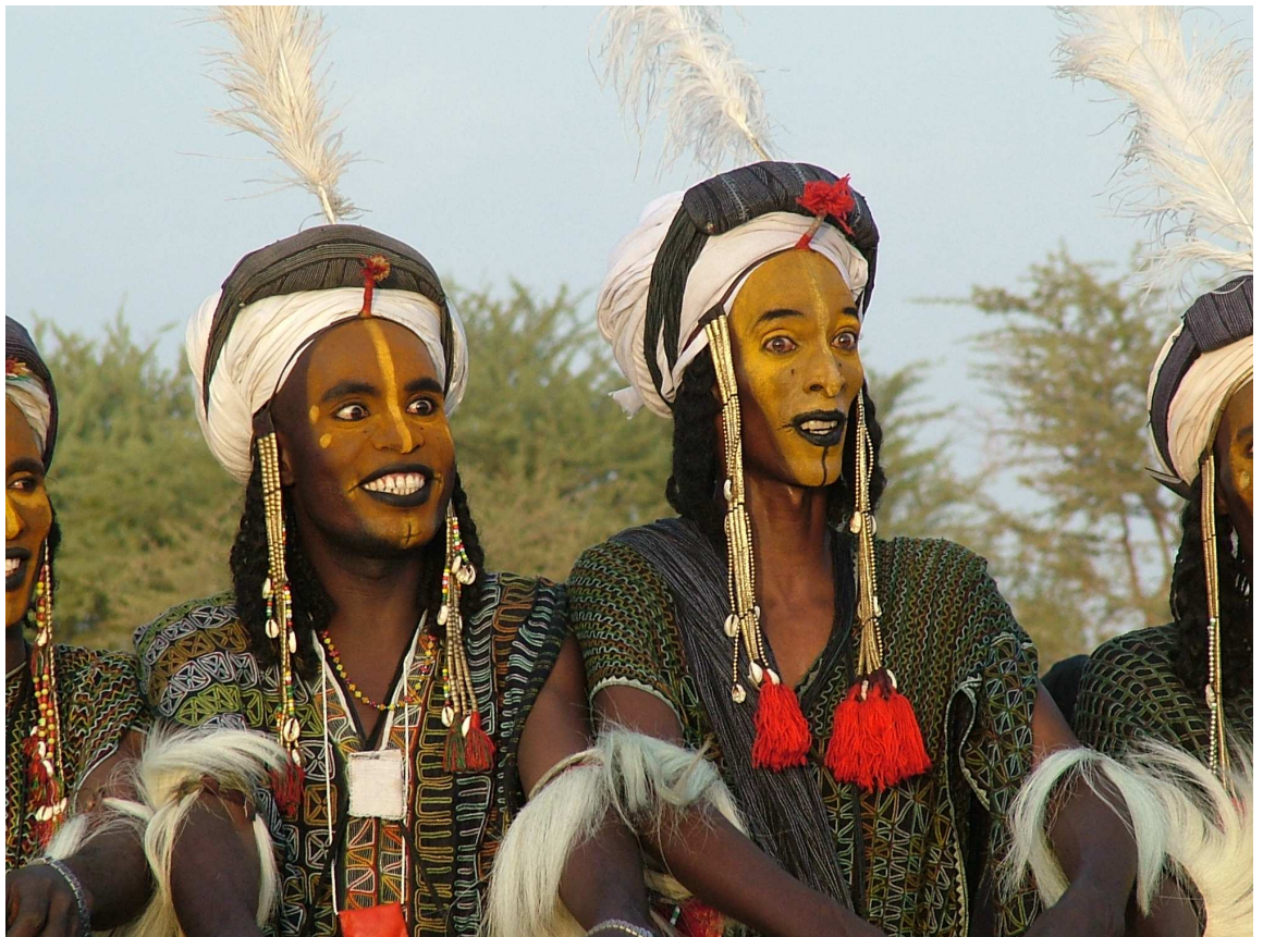
Gerewol, Niger, October 2004 (photo by: Tina Imbriano from the exhibition "Faces from the South of the World")